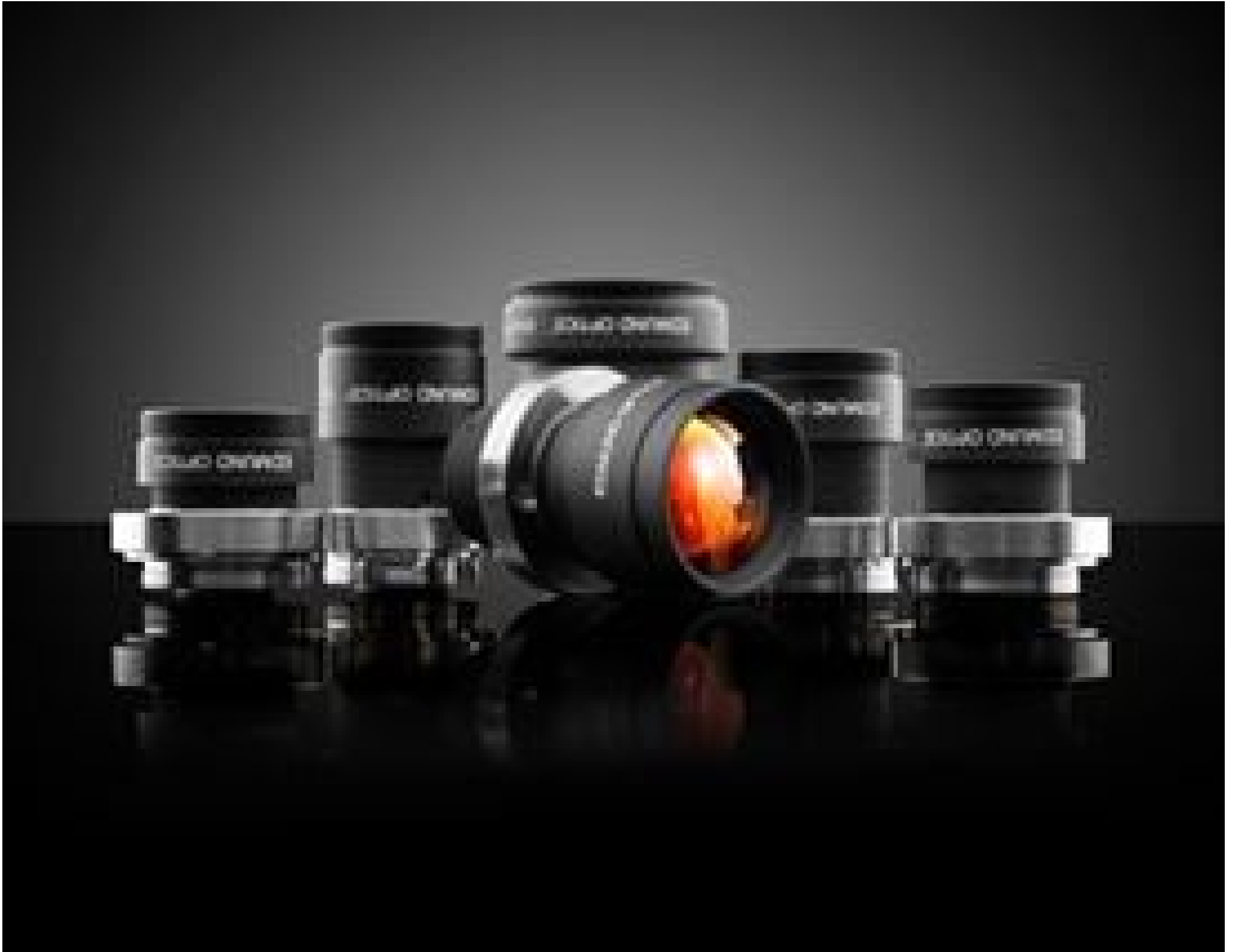
TECHSPEC® Cr Series Fixed Focal Length Lenses