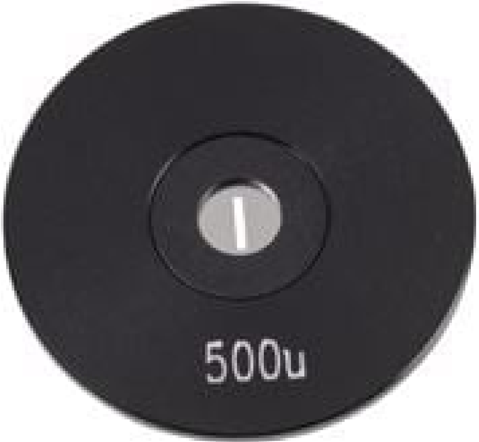
Mounted Precision Air Slit