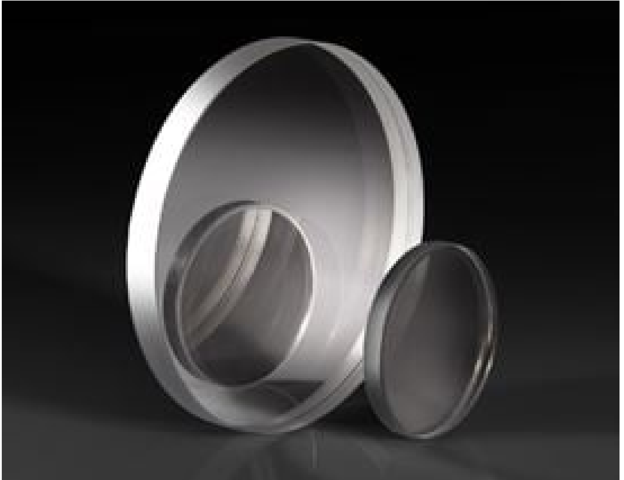
UV-NIR Neutral Density Filters