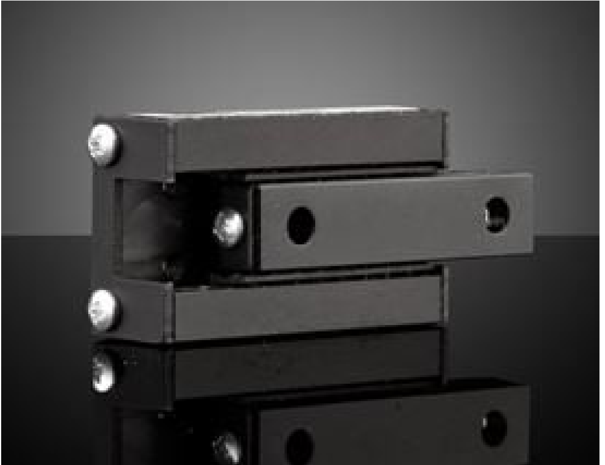
0.5" Travel, 1.12"L x 0.59"W Ball Bearing Slide, #53-849