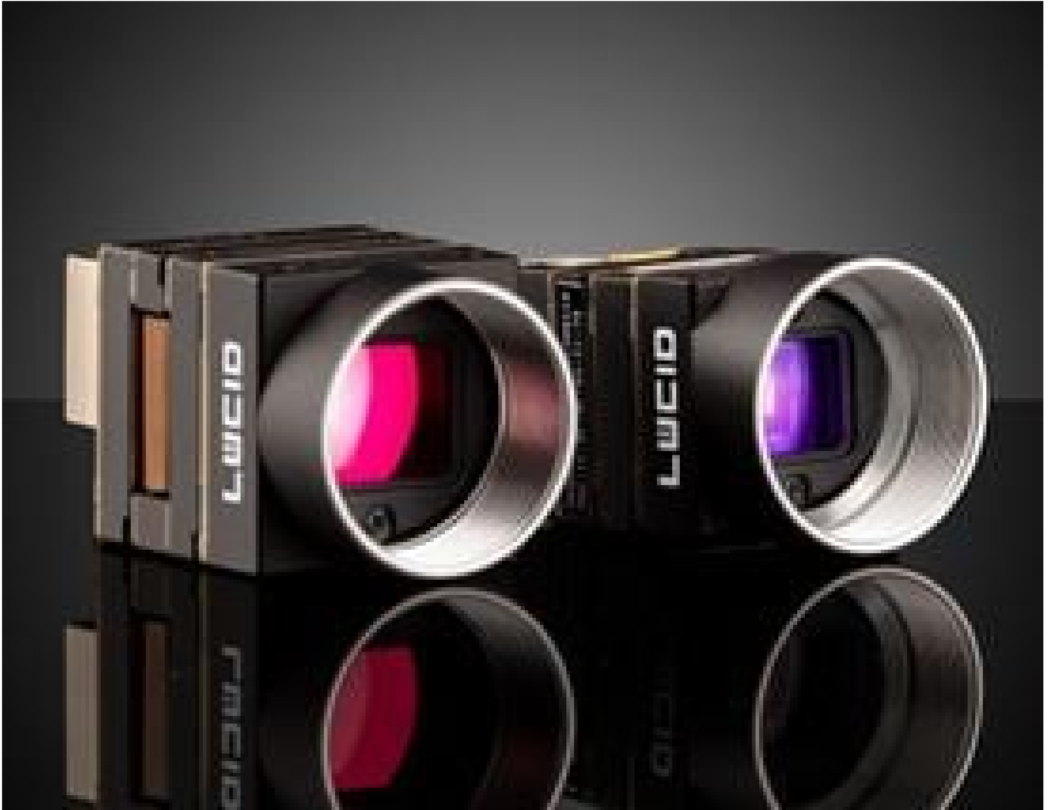
LUCID Vision Labs Phoenix™ Power over Ethernet (PoE) Cameras